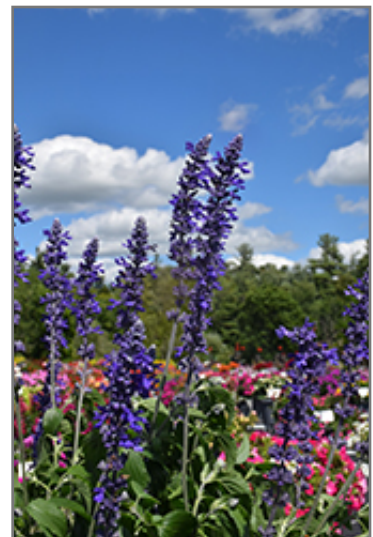
Mystic Spires Sage flowers