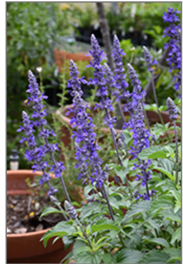
Mystic Spires Sage flowers

Mystic Spires Sage is an herbaceous perennial with an upright spreading habit of growth. Its relatively fine texture sets it apart from other garden plants with less refined foliage.