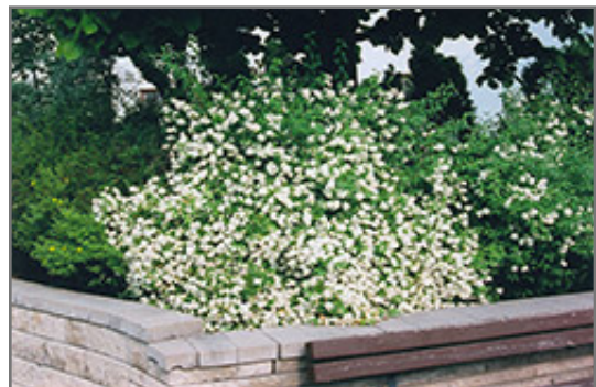
Galahad Mockorange in bloom