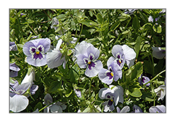
Panola Marina Pansy flowers