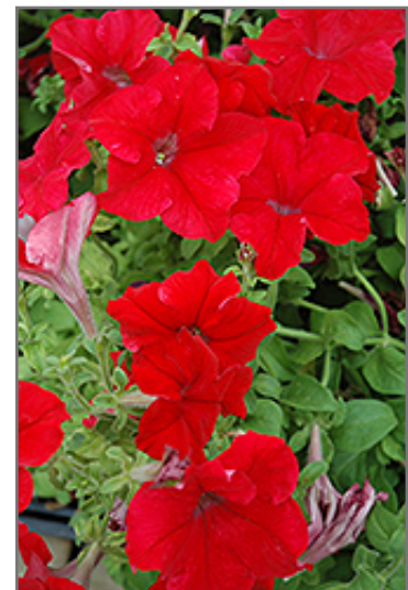
Dreams Red Petunia flowers

2901 ST. MARY'S ROAD - WINNIPEG, MANITOBA - R2N 4A6 - (204) 255-7353