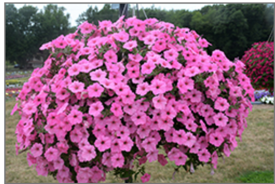
Supertunia Vista Bubblegum Petunia in bloom

Supertunia Vista Bubblegum Petunia will grow to be about 18 inches tall at maturity, with a spread of 24 inches. When grown in masses or used as a bedding plant, individual plants should be spaced approximately 20 inches apart. Its foliage tends to remain dense right to the ground, not requiring facer plants in front. This fast-growing annual will normally live for one full growing season, needing replacement the following year.