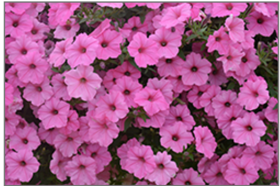
Supertunia Vista Bubblegum Petunia flowers

This plant will require occasional maintenance and upkeep. Trim off the flower heads after they fade and die to encourage more blooms late into the season. It is a good choice for attracting butterflies and hummingbirds to your yard, but is not particularly attractive to deer who tend to leave it alone in favor of tastier treats. It has no significant negative characteristics.