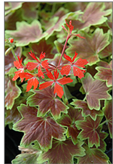
Vancouver Centennial Geranium flowers

Vancouver Centennial Geranium is recommended for the following landscape applications;