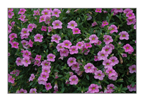
Cabaret Light Pink Calibrachoa flowers

Cabaret Light Pink Calibrachoa is clothed in stunning shell pink trumpet-shaped flowers at the ends of the stems from late spring to early fall. Its small pointy leaves remain green in colour throughout the season.