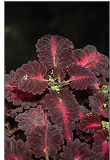
Black Dragon Coleus foliage

Black Dragon Coleus is recommended for the following landscape applications;