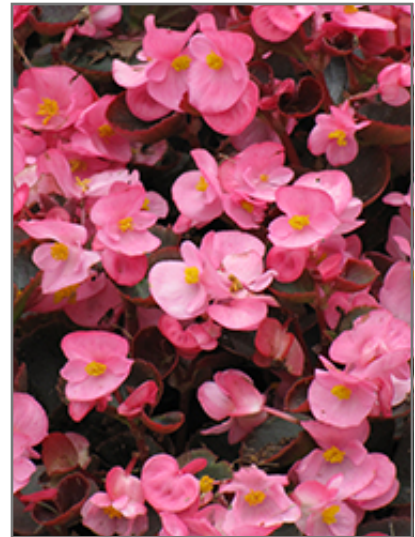
Bada Boom Pink Begonia flowers

Bada Boom Pink Begonia is an herbaceous annual with a mounded form. Its medium texture blends into the garden, but can always be balanced by a couple of finer or coarser plants for an effective composition.