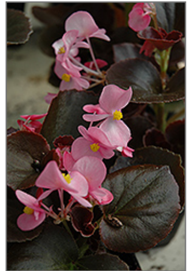
Cocktail Gin Begonia flowers

Cocktail Gin Begonia is an herbaceous annual with a mounded form. Its medium texture blends into the garden, but can always be balanced by a couple of finer or coarser plants for an effective composition.