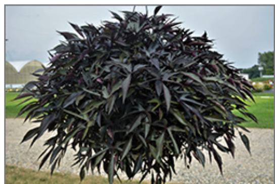
Illusion Midnight Lace Sweet Potato Vine