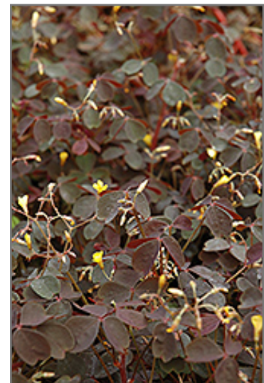
Burgundy Bliss Shamrock flowers