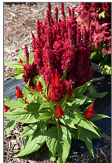
Fresh Look Red Celosia in bloom

2901 ST. MARY'S ROAD - WINNIPEG, MANITOBA - R2N 4A6 - (204) 255-7353