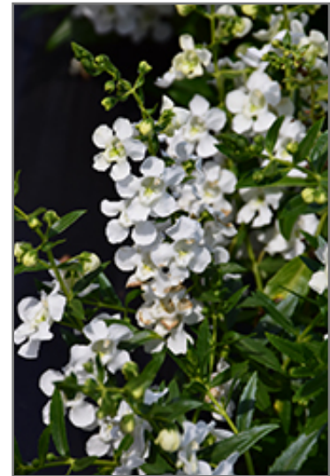
AngelMist Spreading White Angelonia flowers

AngelMist Spreading White Angelonia is an herbaceous annual with an upright spreading habit of growth. Its relatively fine texture sets it apart from other garden plants with less refined foliage.