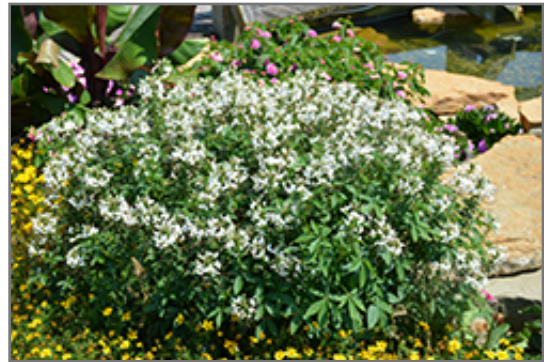
Senorita Blanca Spiderflower in bloom