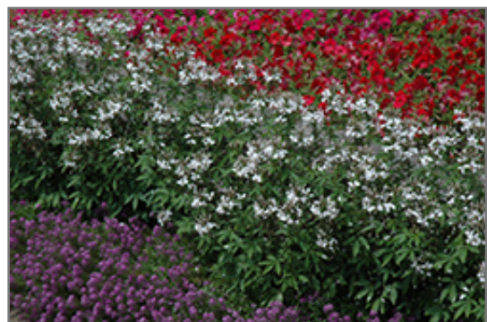
Senorita Blanca Spiderflower in bloom