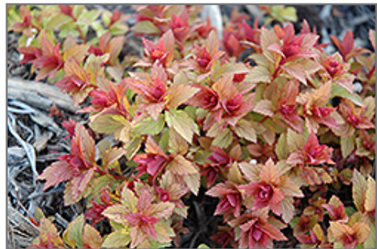
Magic Carpet Spirea foliage