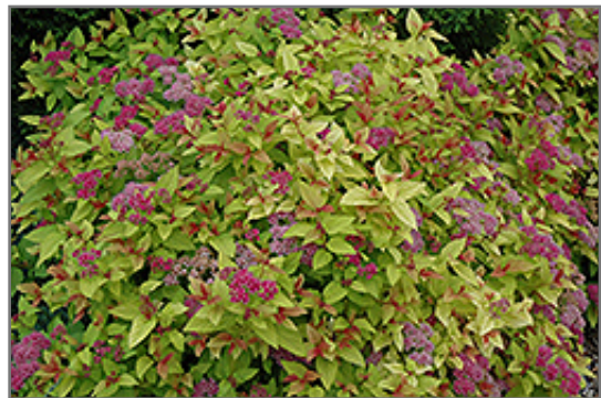
Magic Carpet Spirea flowers