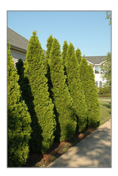
Emerald Green Arborvitae