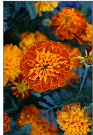
Bonanza Harmony Marigold flowers

This is a relatively low maintenance plant. Trim off the flower heads after they fade and die to encourage more blooms late into the season. Deer don't particularly care for this plant and will usually leave it alone in favor of tastier treats. It has no significant negative characteristics.