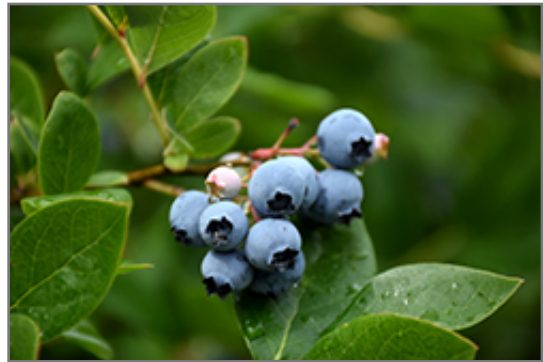
Northcountry Blueberry fruit