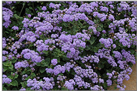
High Tide Blue Flossflower in bloom

High Tide Blue Flossflower is a fine choice for the garden, but it is also a good selection for planting in outdoor containers and hanging baskets. It is often used as a 'filler' in the 'spiller-thriller-filler' container combination, providing a mass of flowers against which the thriller plants stand out. Note that when growing plants in outdoor containers and baskets, they may require more frequent waterings than they would in the yard or garden.