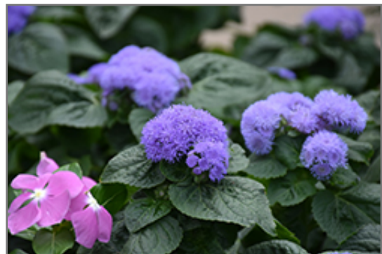
High Tide Blue Flossflower flowers