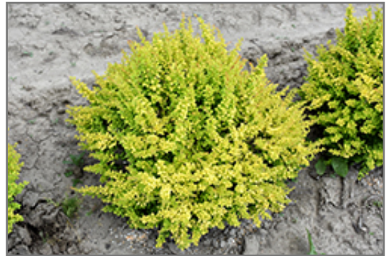
Sunsation Japanese Barberry

Sunsation Japanese Barberry is a dense multi-stemmed deciduous shrub with a more or less rounded form. Its relatively fine texture sets it apart from other landscape plants with less refined foliage.