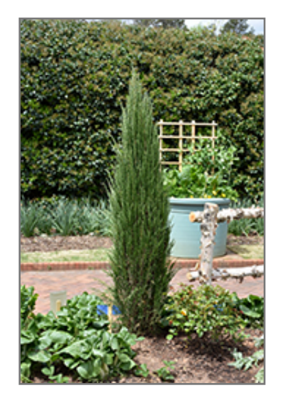
Blue Arrow Juniper