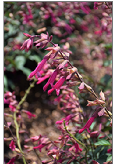
Wendy's Wish Sage flowers

Wendy's Wish Sage is an herbaceous annual with an upright spreading habit of growth. Its medium texture blends into the garden, but can always be balanced by a couple of finer or coarser plants for an effective composition.