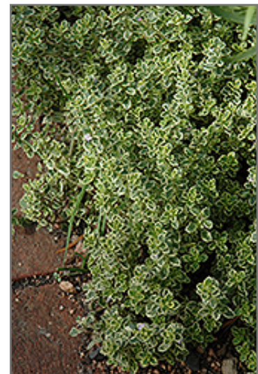
Aureus Lemon Thyme foliage