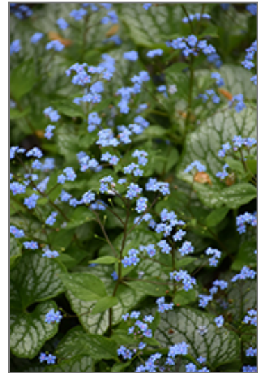
Sea Heart Bugloss flowers

Sea Heart Bugloss is an herbaceous perennial with a mounded form. Its relatively coarse texture can be used to stand it apart from other garden plants with finer foliage.