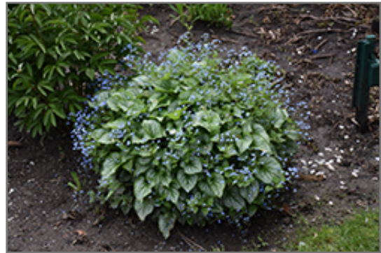
Sea Heart Bugloss in bloom

Sea Heart Bugloss will grow to be about 12 inches tall at maturity extending to 16 inches tall with the flowers, with a spread of 18 inches. When grown in masses or used as a bedding plant, individual plants should be spaced approximately 14 inches apart. It grows at a medium rate, and under ideal conditions can be expected to live for approximately 10 years. As an herbaceous perennial, this plant will usually die back to the crown each winter, and will regrow from the base each spring. Be careful not to disturb the crown in late winter when it may not be readily seen!