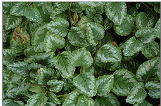
Jade Frost Archangel foliage