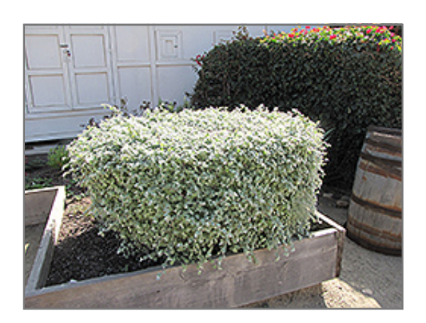
Licorice Plant

This is a relatively low maintenance plant, and can be pruned at anytime. Deer don't particularly care for this plant and will usually leave it alone in favor of tastier treats. It has no significant negative characteristics.