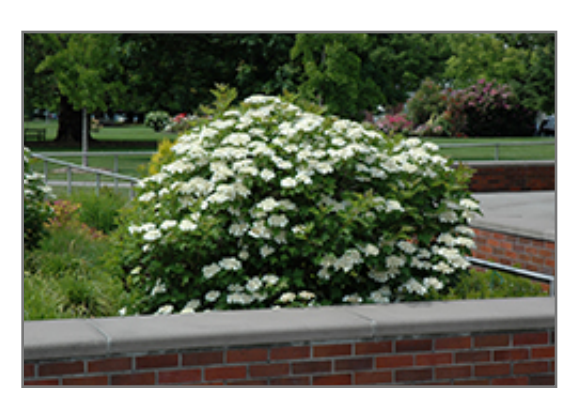
Bailey Compact Highbush Cranberry in bloom