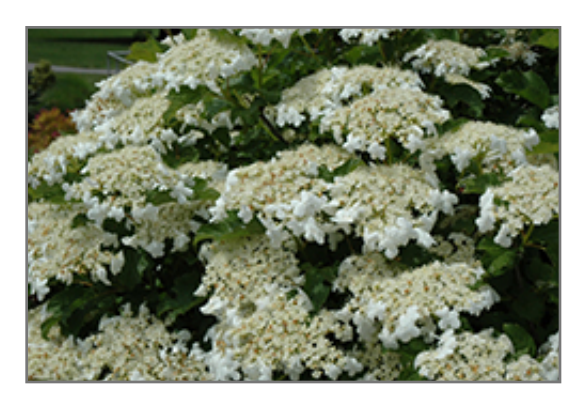
Bailey Compact Highbush Cranberry flowers