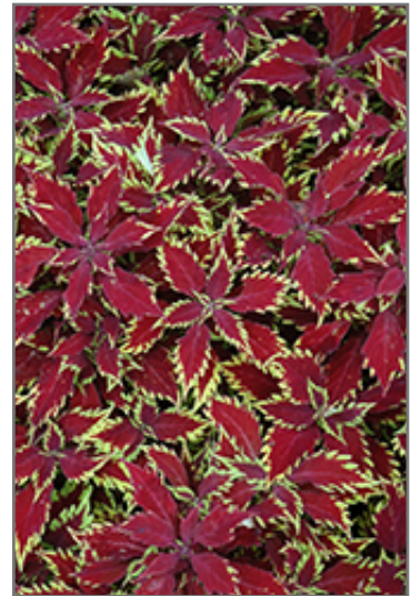
ColorBlaze Royale Apple Brandy Coleus foliage

This is a relatively low maintenance plant. The flowers of this plant may actually detract from its ornamental features, so they can be removed as they appear. Deer don't particularly care for this plant and will usually leave it alone in favor of tastier treats. It has no significant negative characteristics.