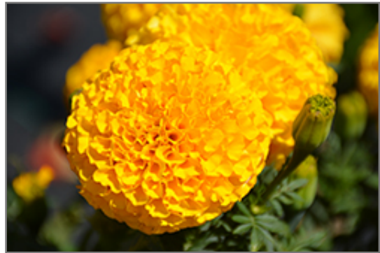
Taishan Gold Marigold flowers

Taishan Gold Marigold is an herbaceous annual with an upright spreading habit of growth. It brings an extremely fine and delicate texture to the garden composition and should be used to full effect.