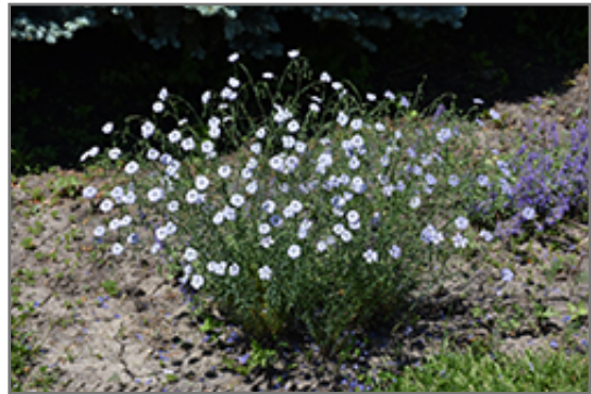
Blue Sapphire Perennial Flax in bloom

Blue Sapphire Perennial Flax is an open herbaceous perennial with an upright spreading habit of growth. It brings an extremely fine and delicate texture to the garden composition and should be used to full effect.