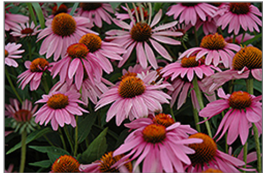
Magnus Coneflower flowers

Magnus Coneflower is an herbaceous perennial with an upright spreading habit of growth. Its medium texture blends into the garden, but can always be balanced by a couple of finer or coarser plants for an effective composition.