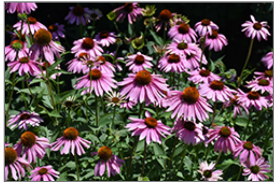
Magnus Coneflower flowers