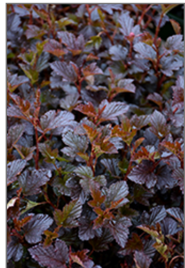
Petite Plum Ninebark foliage