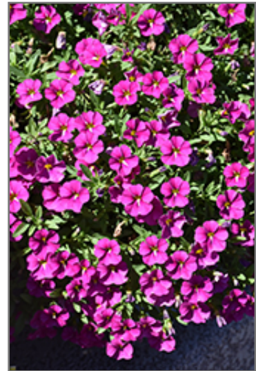
Cabaret Pink Star Calibrachoa flowers

Cabaret Pink Star Calibrachoa is a dense herbaceous annual with a trailing habit of growth, eventually spilling over the edges of hanging baskets and containers. Its medium texture blends into the garden, but can always be balanced by a couple of finer or coarser plants for an effective composition.