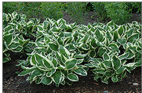
Minuteman Hosta