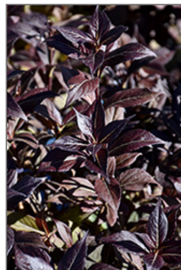
Date Night Stunner Weigela foliage