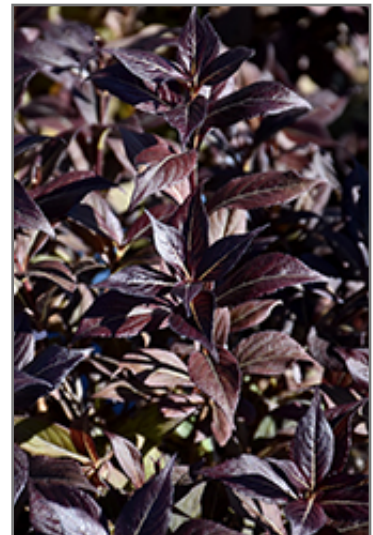
Date Night Stunner Weigela foliage