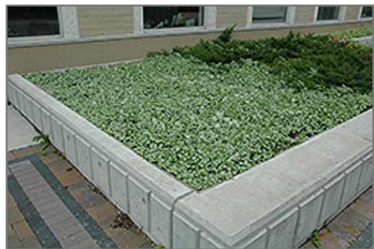
White Nancy Spotted Dead Nettle in bloom