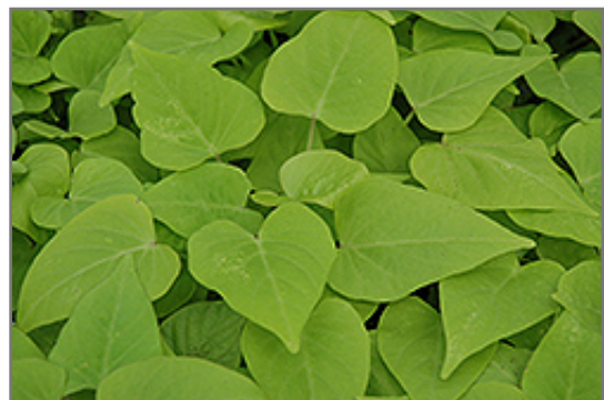
Sweet Caroline Sweetheart Light Green Sweet Potato Vine foliage