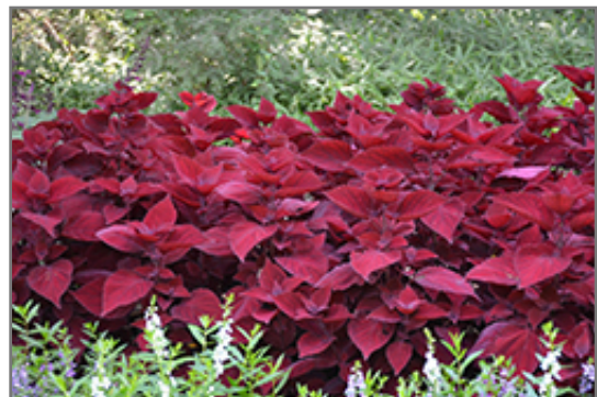
Beale Street Coleus