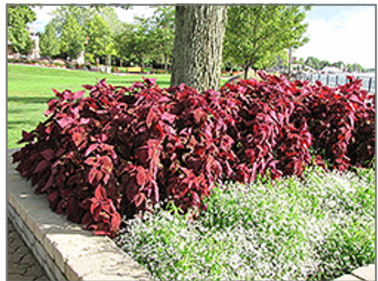
ColorBlaze Rediculous Coleus