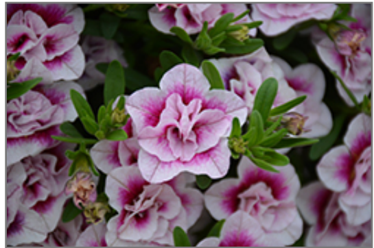
MiniFamous Uno Double PinkTastic Calibrachoa flowers

MiniFamous Uno Double PinkTastic Calibrachoa is a dense herbaceous annual with a trailing habit of growth, eventually spilling over the edges of hanging baskets and containers. Its medium texture blends into the garden, but can always be balanced by a couple of finer or coarser plants for an effective composition.