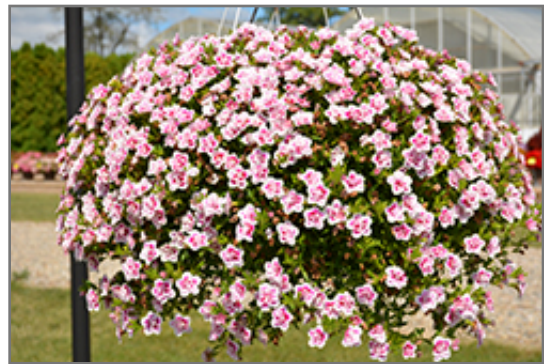
MiniFamous Uno Double PinkTastic Calibrachoa in bloom