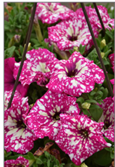
Headliner Pink Sky Petunia flowers

2901 ST. MARY'S ROAD - WINNIPEG, MANITOBA - R2N 4A6 - (204) 255-7353