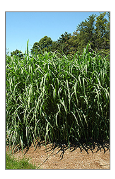
Giant Silver Grass