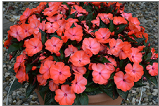
Magnum Wild Salmon New Guinea Impatiens in bloom

Magnum Wild Salmon New Guinea Impatiens is a fine choice for the garden, but it is also a good selection for planting in outdoor containers and hanging baskets. It is often used as a 'filler' in the 'spiller-thriller-filler' container combination, providing a mass of flowers against which the thriller plants stand out. Note that when growing plants in outdoor containers and baskets, they may require more frequent waterings than they would in the yard or garden.