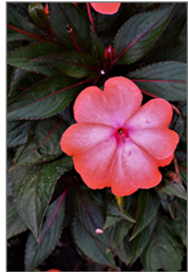
Magnum Wild Salmon New Guinea Impatiens flowers

Magnum Wild Salmon New Guinea Impatiens is a dense herbaceous annual with a mounded form. Its medium texture blends into the garden, but can always be balanced by a couple of finer or coarser plants for an effective composition.