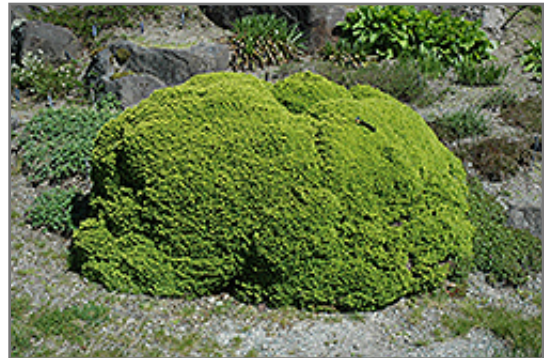
Little Gem Spruce

Little Gem Spruce is a dense multi-stemmed evergreen shrub with a more or less rounded form. Its relatively fine texture sets it apart from other landscape plants with less refined foliage.