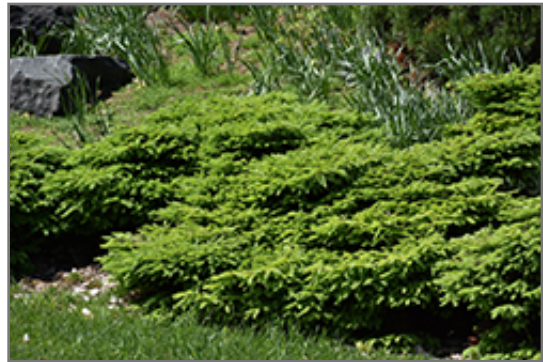
Little Gem Spruce

This plant is not reliably hardy in our region, and certain restrictions may apply; contact the store for more information.