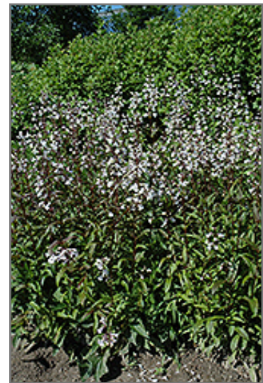
Husker Red Beard Tongue in bloom

Husker Red Beard Tongue is a fine choice for the garden, but it is also a good selection for planting in outdoor pots and containers. With its upright habit of growth, it is best suited for use as a 'thriller' in the 'spiller-thriller-filler' container combination; plant it near the center of the pot, surrounded by smaller plants and those that spill over the edges. Note that when growing plants in outdoor containers and baskets, they may require more frequent waterings than they would in the yard or garden. Be aware that in our climate, most plants cannot be expected to survive the winter if left in containers outdoors, and this plant is no exception. Contact our experts for more information on how to protect it over the winter months.