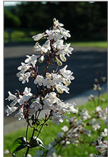
Husker Red Beard Tongue flowers

This is a relatively low maintenance plant, and is best cleaned up in early spring before it resumes active growth for the season. It is a good choice for attracting butterflies and hummingbirds to your yard. It has no significant negative characteristics.