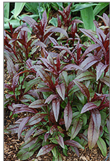
Husker Red Beard Tongue foliage

2901 ST. MARY'S ROAD - WINNIPEG, MANITOBA - R2N 4A6 - (204) 255-7353