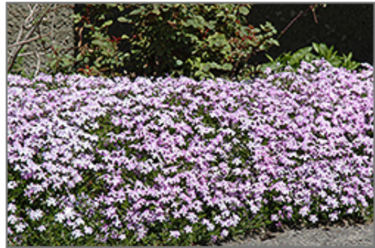
Emerald Blue Moss Phlox in bloom

This plant does best in full sun to partial shade. It prefers dry to average moisture levels with very well-drained soil, and will often die in standing water. It is considered to be drought-tolerant, and thus makes an ideal choice for a low-water garden or xeriscape application. It is not particular as to soil type, but has a definite preference for alkaline soils. It is highly tolerant of urban pollution and will even thrive in inner city environments. Consider covering it with a thick layer of mulch in winter to protect it in exposed locations or colder microclimates. This is a selection of a native North American species. It can be propagated by division; however, as a cultivated variety, be aware that it may be subject to certain restrictions or prohibitions on propagation.