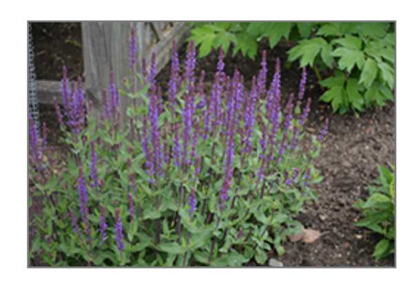
Caradonna Sage in bloom

Caradonna Sage is an herbaceous perennial with an upright spreading habit of growth. Its relatively fine texture sets it apart from other garden plants with less refined foliage.