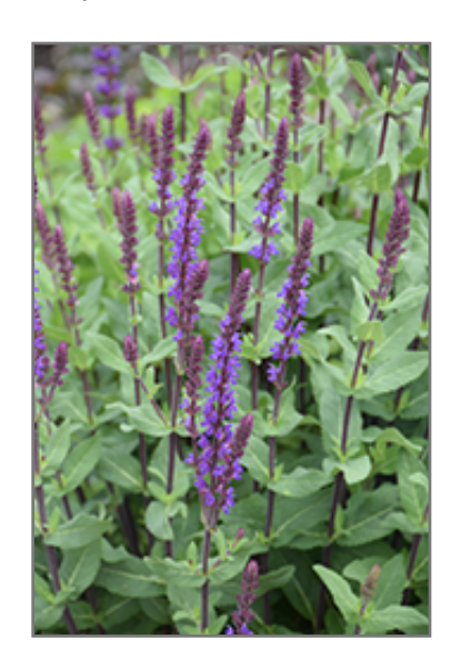
Caradonna Sage flowers