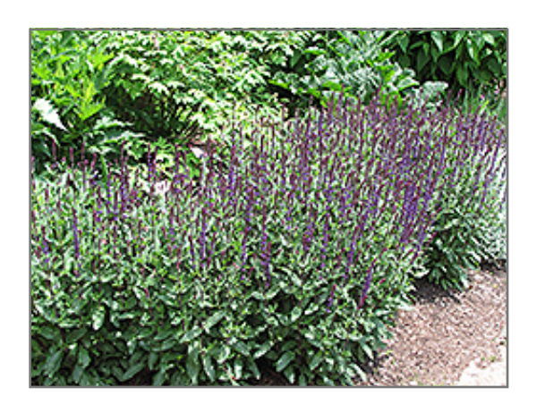
Caradonna Sage in bloom

Caradonna Sage will grow to be about 24 inches tall at maturity, with a spread of 24 inches. When grown in masses or used as a bedding plant, individual plants should be spaced approximately 18 inches apart. It grows at a medium rate, and under ideal conditions can be expected to live for approximately 5 years. As an herbaceous perennial, this plant will usually die back to the crown each winter, and will regrow from the base each spring. Be careful not to disturb the crown in late winter when it may not be readily seen!