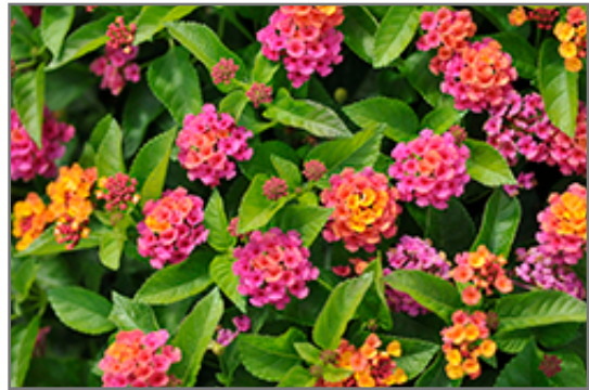
Bloomify Rose Lantana flowers

Bloomify Rose Lantana is a multi-stemmed annual with a mounded form. Its medium texture blends into the garden, but can always be balanced by a couple of finer or coarser plants for an effective composition.