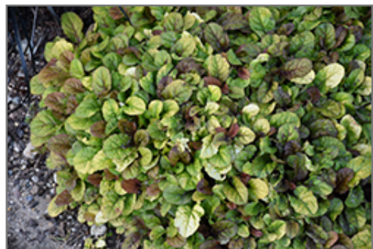
Feathered Friends Parrot Paradise Bugleweed